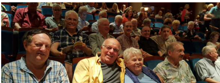
Kinky Boots, Broward Center for the Arts, March 2, 2016