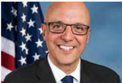
Rep. Ted Deutch

The U.S. Congressional LGBT Equality Caucus, formed in 2008, recently created the LGBT Aging Issues Task Force, a new bipartisan group to examine the unique challenges and vulnerabilities faced by LGBT elders. South Florida is well represented on the task force. Rep. Ted Deutch (D-FL), who represents Broward and Palm Beach counties, will serve as chair for the task force. Rep. Lois Frankel (D-FL), who represents parts of Broward and Palm Beach counties, Rep. Ileana Ros-Lehtinen (R-FL), who represents Miami-Dade county, and Rep. Patrick Murphy (D-FL), who represents northern Palm Beach, Martin and St. Lucie counties, will also serve on the ten-person task force.