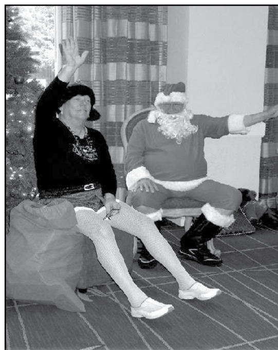
Santa and his favorite elf.

SIGN UP NOW!!! (SEE FLYER FOR DETAILS AND SIGN UP FORM).