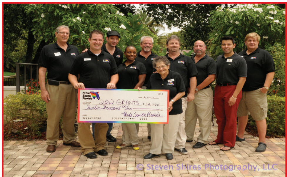
2012 Pride of South Florida volunteers.