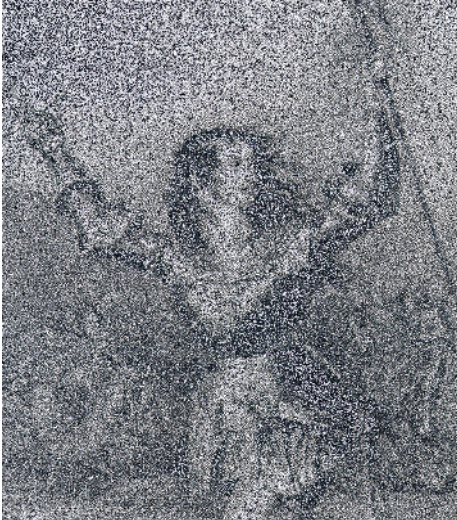
Joan of Arc

Anderson Cooper has finally come out. So has Frank Ocean, a singer with Odd Future (whatever that is). Ocean's statement is apparently quite noteworthy because rap music has always been homophobic.