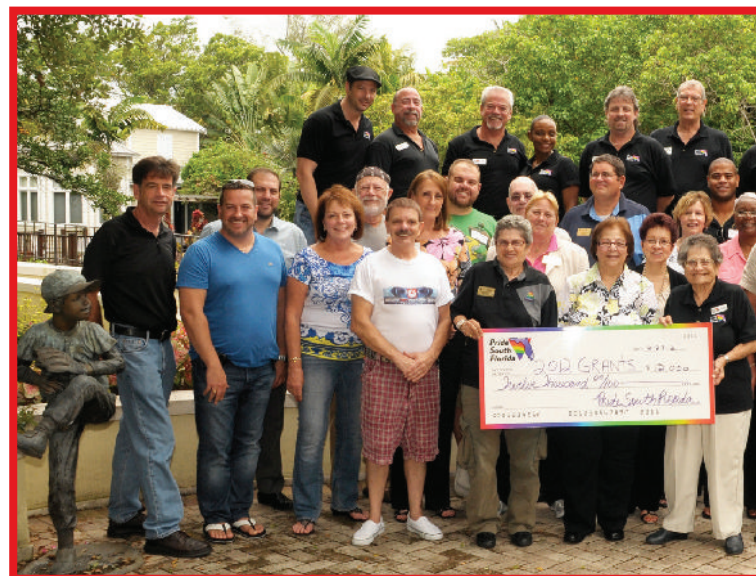
Pride of South Florida Volunteers with 2011 grant recipients.