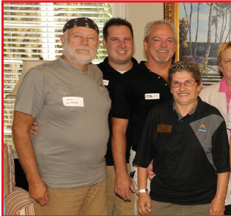
SAGE of South Florida Board of Directors accepts 2011 Pride of South Florida grant.