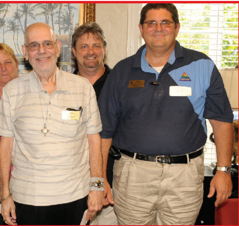
da grant./Photo courtesy of Steven Shires Photography, LLC ©