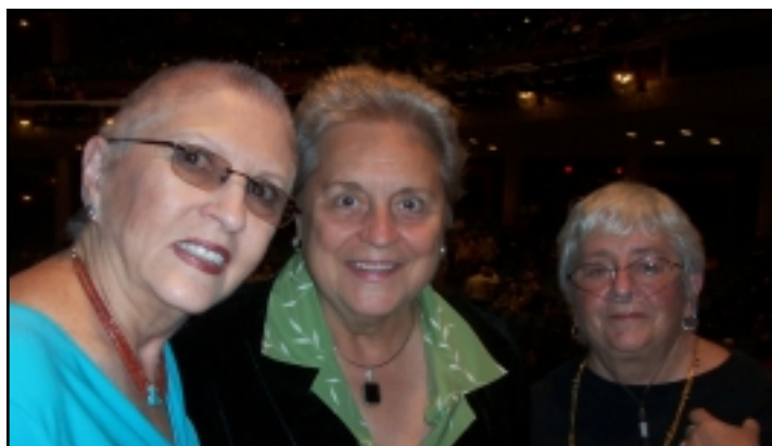
Members attend Barbara Cook concert.