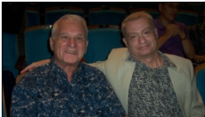
Members attend Barbara Cook concert.