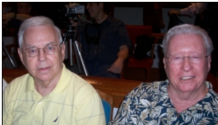
Members attend Barbara Cook concert.